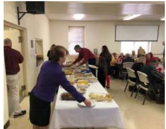
Christmas Cantata and Covered Dish Luncheon