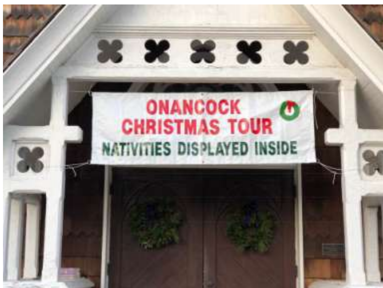
A wondrous display of well over 70 nativities made of all types of materials from all around the world, generously shared by Market Street community members.